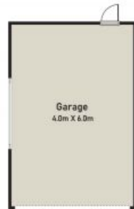
Potential DA Approved Granny Flat