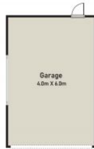
Potential DA Approved Granny Flat