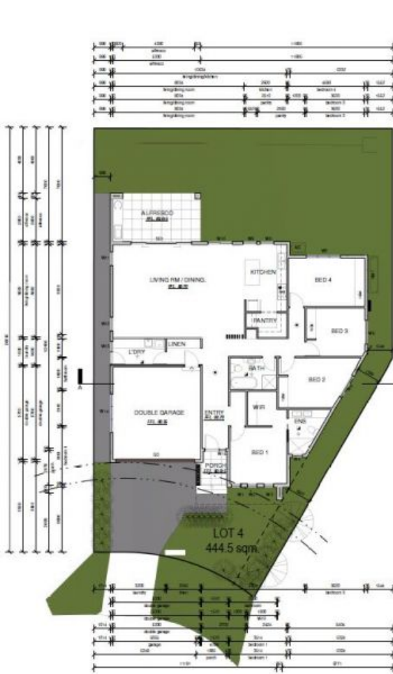
1 Ground Floor Level 1:100